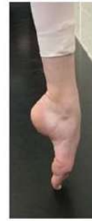
Photo (c) demonstrates the extreme position of the foot on pointe, indicating how the weight of the body is carried through the ankle joint