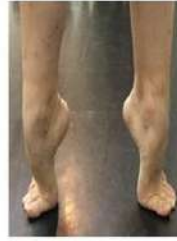
Photo (b) demonstrates demi pointe with lengthened toes