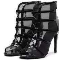
High Heel Latin shoes